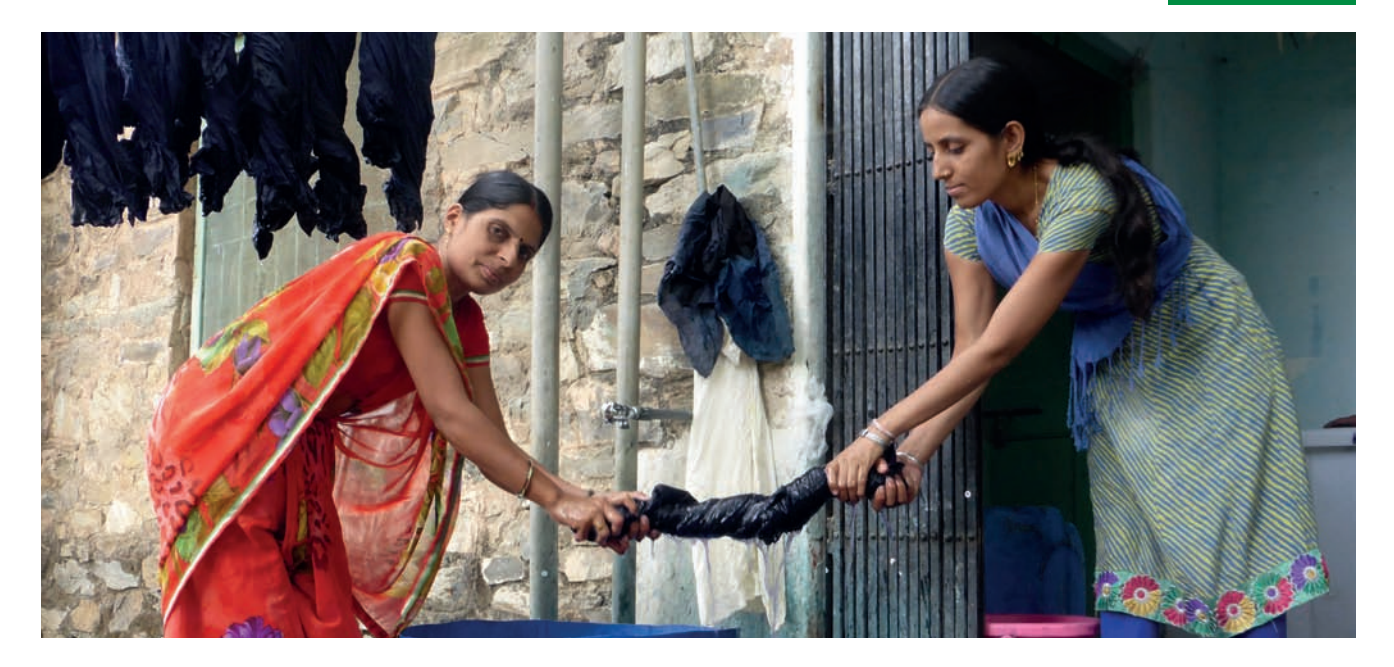
The India Competence Center at the University of St.Gallen advances the understanding of doing business in India and with Indian companies in a global context.