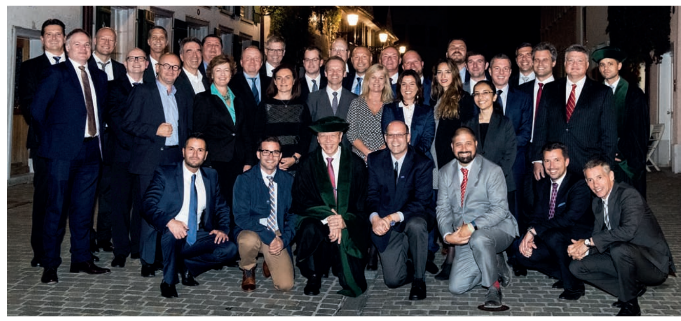
We are proud to have established a truly interdisciplinary Advisory Board to the Corporate Governance Competence Center uniting personalities from academia, the business world and investors.