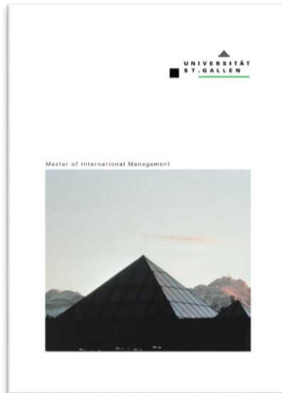
MIM Brochure, 2001

program which served as the predecessor of our current Master of Strategy and International Management (SIM-HSG) program.